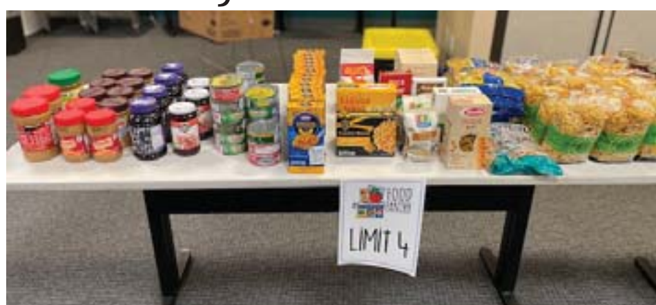
A sample of food offered at the new food pantry at Moraga Valley Presbyterian Church.